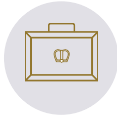
Clients with large ISA portfolios