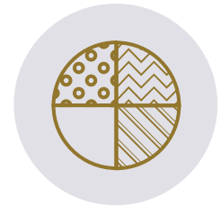
Those seeking diversification