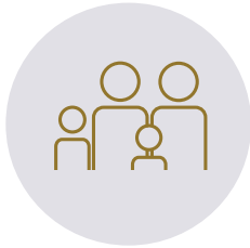
Families with children or grandchildren