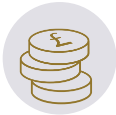
Those seeking a regular income