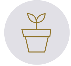
Clients seeking to leave a legacy