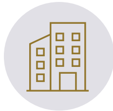
Clients who have sold or are selling a business